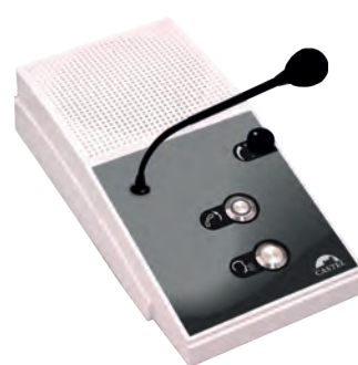
KIT INTERPHONE DE GUICHET PLATINE AV Kit with an operator station and a client (visitor) station vandal-proof version REF 470.9300