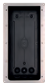
FOND ENCASTRABLE XE PLATINE AUDIO Flush-mounted bottom for XE PLATINE AUDIO REF 590.9860