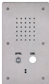
XE-1B-CELL-L Audio Full IP/SIP cell intercom with 1 call button and 1 pending place for lighting control REF 550.0905