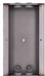
FOND ENCASTRABLE MAYLIS LIAISON Flush-mounted bottom for prison intercoms of Maylis range REF 550.0550 › Stainless steel 316L bottom › H 210 mm x W 118 mm x D 55 mm Also available with 1 or 2 tampers