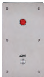
PL-1B-COR-H Corridor station with 1 acknowledgement button and 1 light indicator REF 550.0960