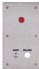
PL-1B-COR-H-L Corridor station with 1 acknowledgement button, 1 light indicator and 1 pending place for lighting control REF 550.0965