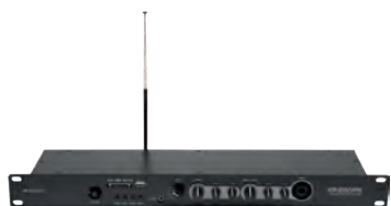
TUNER RADIO FM Rackable 1U universal preamplifier REF 310.2200