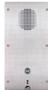
XE-1B-CELL-SENS Audio Full IP/SIP cell intercom with 1 call button and sensitive front panel REF 550.5510