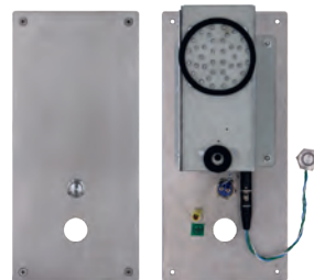
XE-1B-HUISSERIE Full IP/SIP cell kit for frame integration REF 550.0600