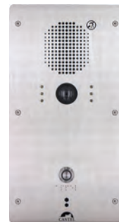
XE-V1B-CELL-ADAPT Audio video Full IP/SIP cell intercom DDA compliant REF 550.5410