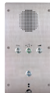
XE-1B-CELL-RADIO Audio Full IP/SIP cell intercom with 1 call button and radio function REF 550.6000