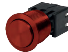
INTER COUPURE GENERALE CELLULE Eco Energy switch REF 102163