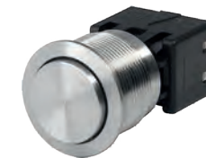
INTER ECLAIRAGE CELLULE Cell light control switch REF 102169