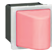
VOYANT HUBLOT LED ROUGE 24V Low-energy red LED light indicator REF 102164