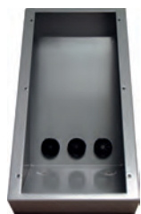
SUPPORT XE PLATINE AUDIO Inclined desk stand for XE PLATINE AUDIO REF 500.9266