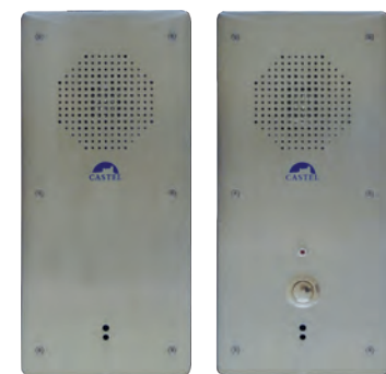
POSTES PARLOIR Stations for visiting rooms prison REF 480.8000 REF 480.8100