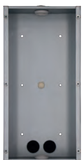
FOND ENCASTRABLE XELLIP LIAISON Flush-mounted bottom for prison intercoms of Xellip range REF 550.5600 › Stainless steel 316L bottom › H 265 mm x W 132 mm x D 63 mm Also available with 1 or 2 tampers